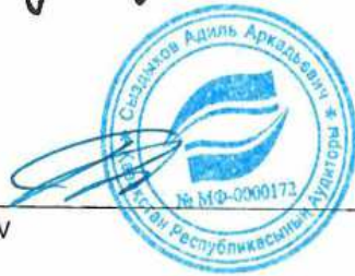
Adil Syzdykov Auditor

Auditor Qualification Certificate No. МФ - 0000172 dated 23 December 2013